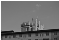
NEW YORK STATE Division of Local Government Services