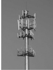
NEW YORK STATE Division of Local Government Services